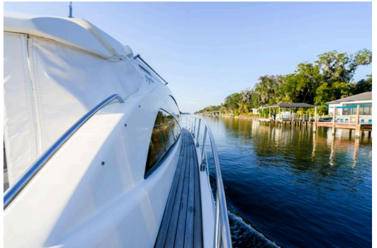
2007 Astondoa 53 Open Cruiser yacht cruising along a scenic waterfront.