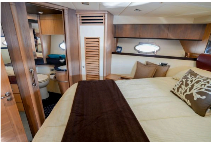
Luxurious cabin interior of 2007 Astondoa 53 Open Cruiser yacht, featuring elegant wood finishes.