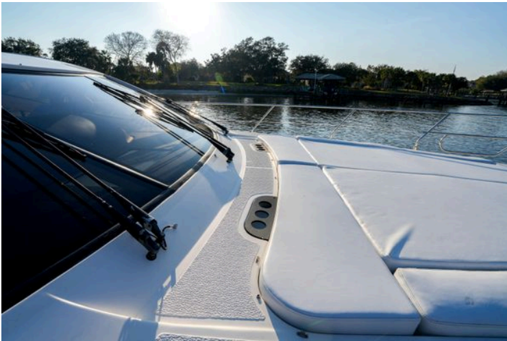
2007 Astondoa 53 Open Cruiser yacht deck with sunpad, docked by a scenic waterfront.