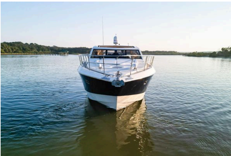
2007 Astondoa 53 Open Cruiser yacht on calm water, front view.