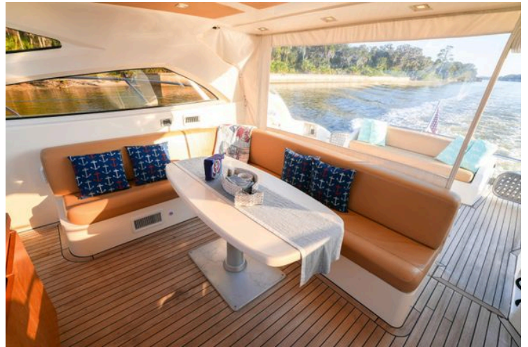
Luxurious 2007 Astondoa 53 Open Cruiser interior with elegant seating and scenic water view.