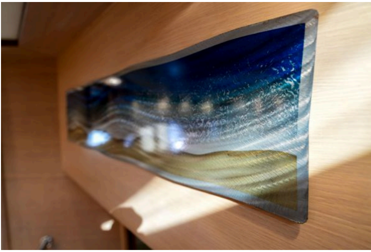
Decorative glass art on 2007 Astondoa 53 Open Cruiser interior wall.