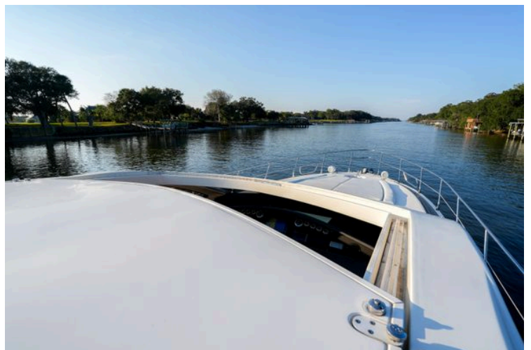
2007 Astondoa 53 Open Cruiser navigating a serene river with lush greenery.