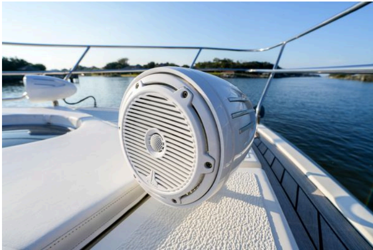
Close-up of a speaker on a 2007 Astondoa 53 Open Cruiser yacht deck.