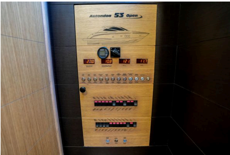
Control panel of a 2007 Astondoa 53 Open Cruiser yacht with digital displays and switches.