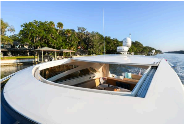
2007 Astondoa 53 Open Cruiser on a scenic river with lush greenery.