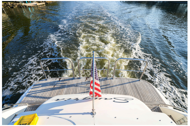
Astondoa 53 Open Cruiser 2007, rear view with American flag on water.