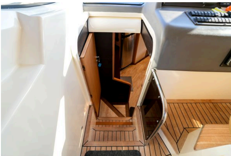
Interior view of 2007 Astondoa 53 Open Cruiser, featuring wooden steps and cabin entrance.