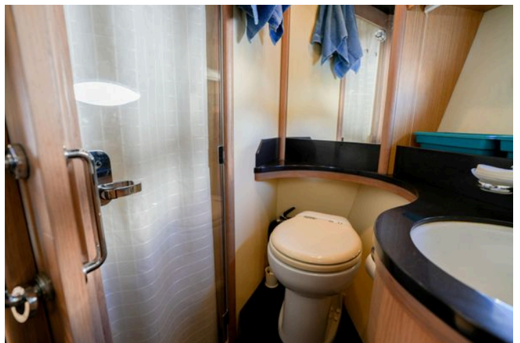
Bathroom interior of 2007 Astondoa 53 Open Cruiser yacht, featuring toilet and shower.