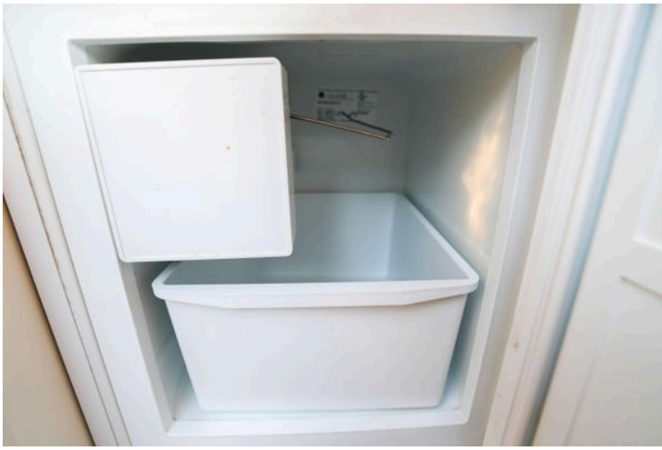
Ice maker compartment with open bin inside a 2007 Astondoa 53 Open Cruiser yacht.