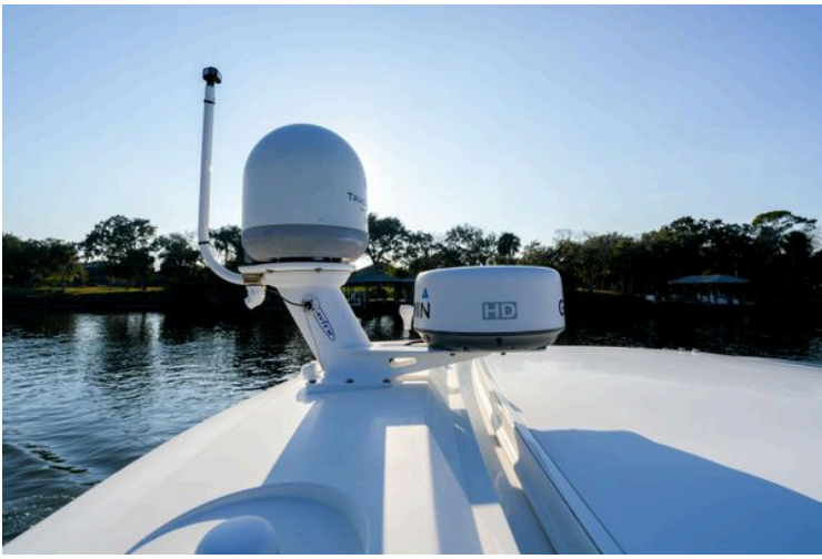
Astondoa 53 Open Cruiser 2007 radar equipment on deck, with scenic water backdrop.