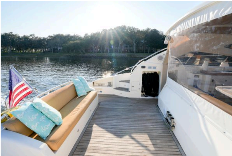
Astondoa 53 Open Cruiser 2007 yacht deck with seating, American flag, and scenic water view.