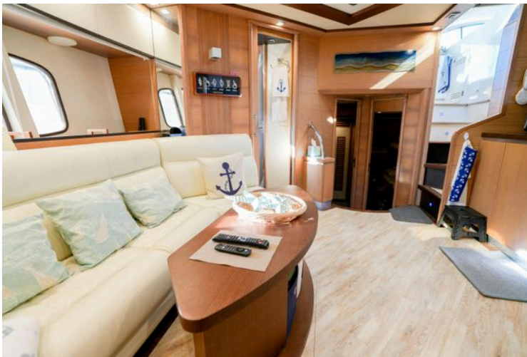
Luxurious interior of 2007 Astondoa 53 Open Cruiser yacht with elegant seating and nautical decor.