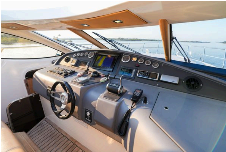
Cockpit of 2007 Astondoa 53 Open Cruiser yacht with navigation instruments and steering wheel.