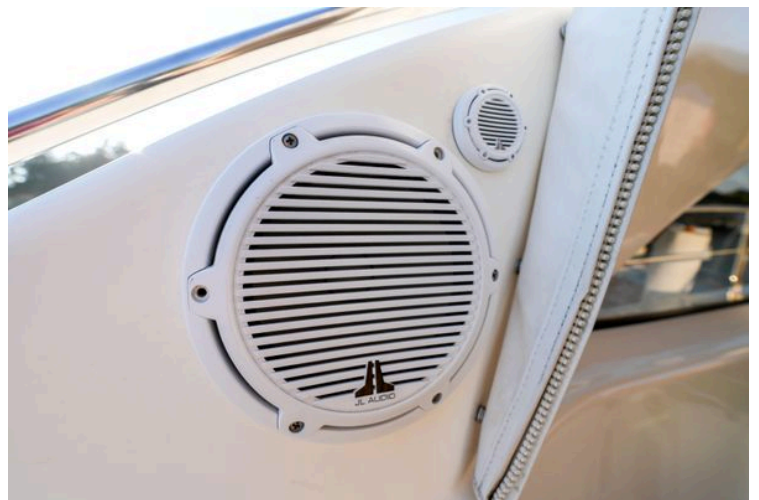
White JL Audio speakers on 2007 Astondoa 53 Open Cruiser yacht interior.