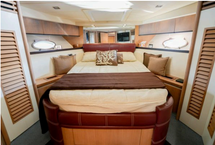
Luxurious cabin interior of 2007 Astondoa 53 Open Cruiser yacht with elegant bedding.