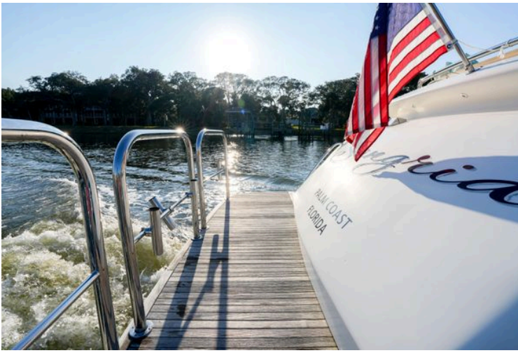
Astondoa 53 Open Cruiser 2007 yacht cruising with American flag, sunny waterside view.