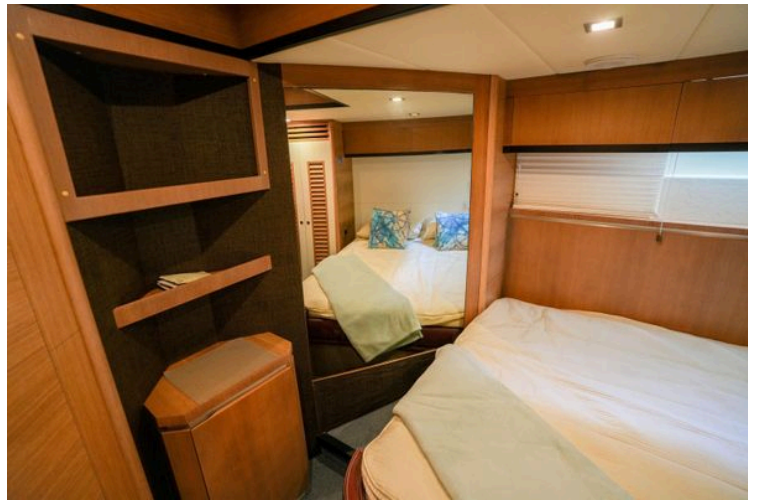
Luxurious cabin interior of 2007 Astondoa 53 Open Cruiser yacht with cozy bedding.