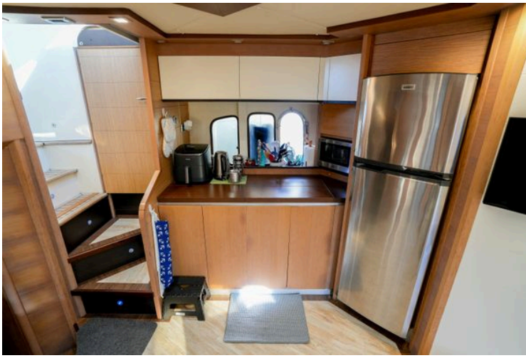
Interior of 2007 Astondoa 53 Open Cruiser with modern kitchen and stainless steel appliances.