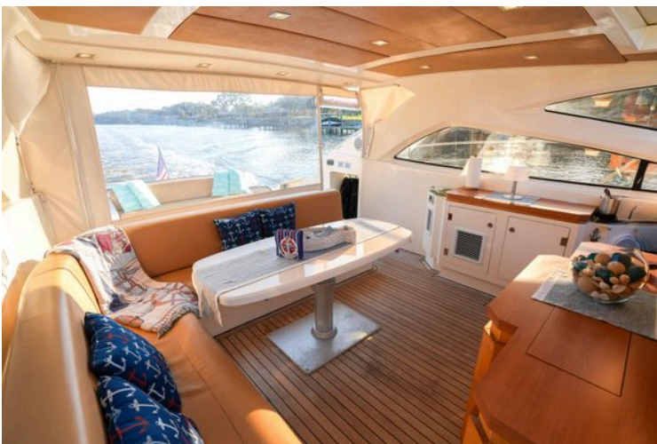
Luxurious interior of 2007 Astondoa 53 Open Cruiser with elegant seating and scenic water view.