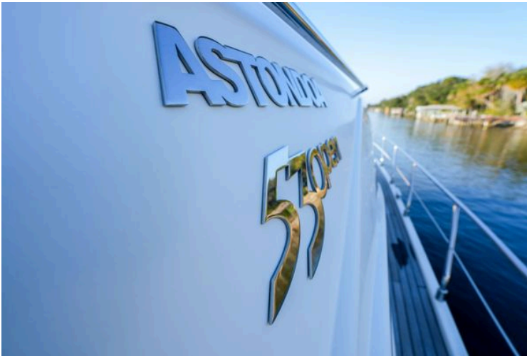
Astondoa 53 Open Cruiser yacht, 2007 model, docked by a scenic waterfront.