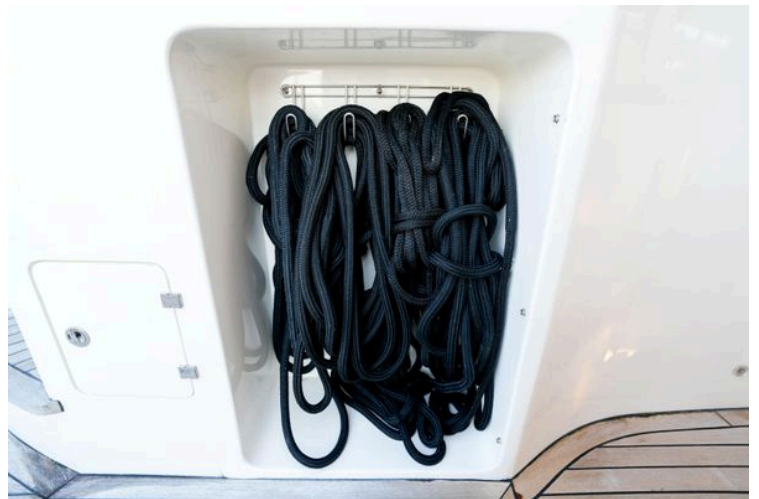
Storage compartment with coiled black ropes on a 2007 Astondoa 53 Open Cruiser yacht.