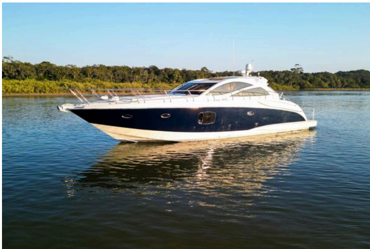
2007 Astondoa 53 Open Cruiser yacht on calm water, surrounded by lush greenery.