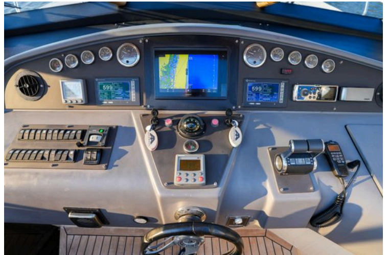
Control panel of a 2007 Astondoa 53 Open Cruiser with navigation and communication equipment.