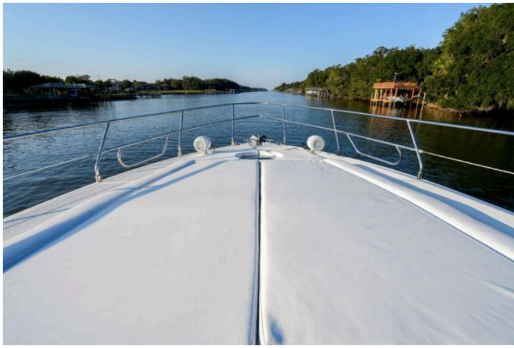
Bow view of 2007 Astondoa 53 Open Cruiser on a serene river.