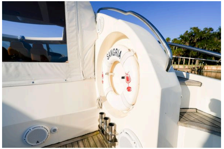
2007 Astondoa 53 Open Cruiser deck with lifebuoy labeled "Sangria."