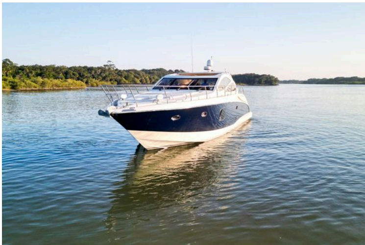
2007 Astondoa 53 Open Cruiser yacht on calm water, surrounded by lush greenery.