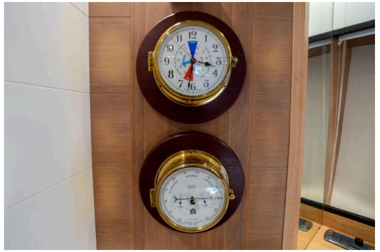
Nautical clock and barometer on Astondoa 53 Open Cruiser, 2007 model, wooden panel.