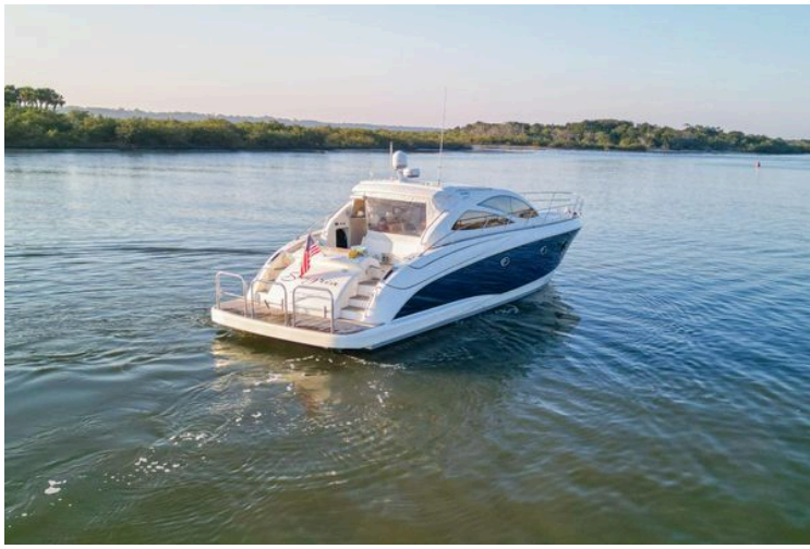
2007 Astondoa 53 Open Cruiser yacht on calm water, scenic background.