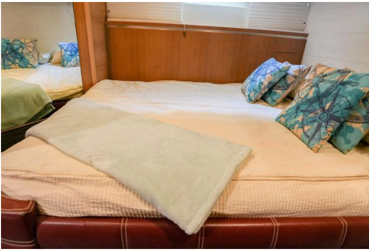
Luxurious bedroom interior of 2007 Astondoa 53 Open Cruiser yacht with decorative pillows.