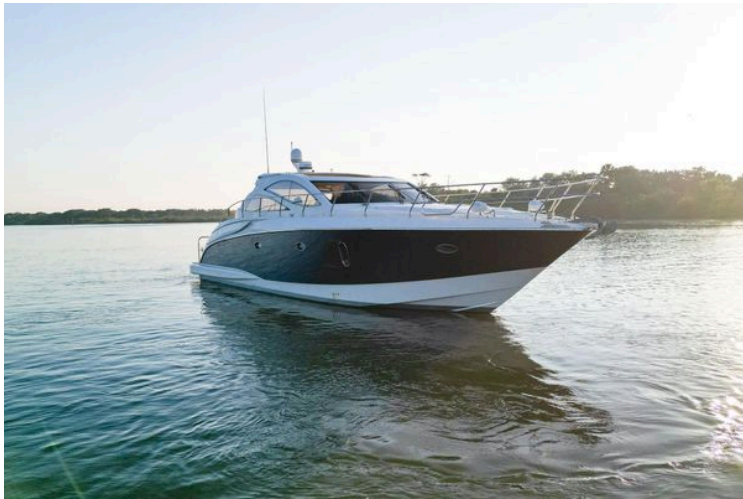
2007 Astondoa 53 Open Cruiser yacht on calm water at sunset.