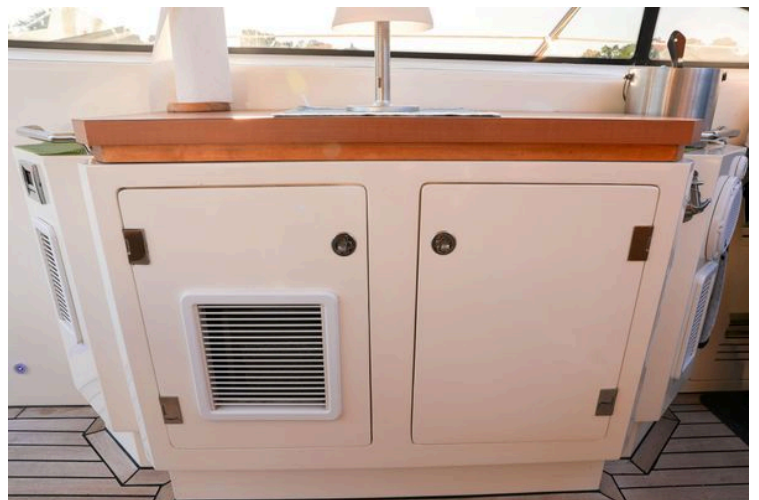
2007 Astondoa 53 Open Cruiser interior with wooden countertop and storage cabinets.