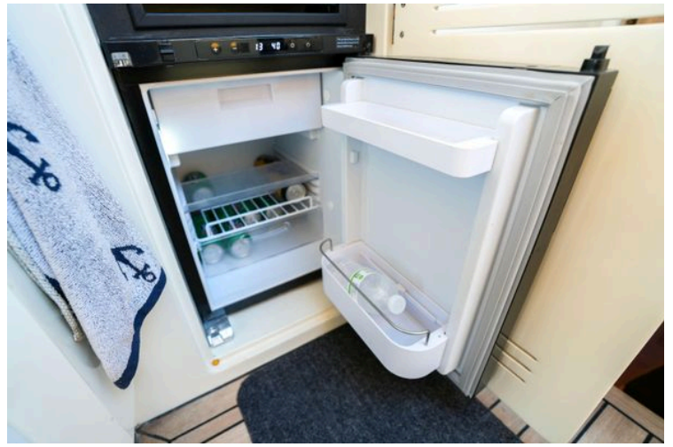
Open mini fridge inside 2007 Astondoa 53 Open Cruiser yacht, stocked with drinks.