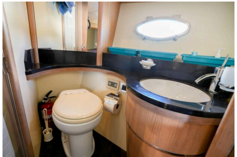
Bathroom interior of 2007 Astondoa 53 Open Cruiser yacht with sink and toilet.