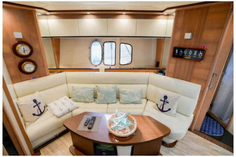
Luxurious interior of 2007 Astondoa 53 Open Cruiser with nautical-themed decor.