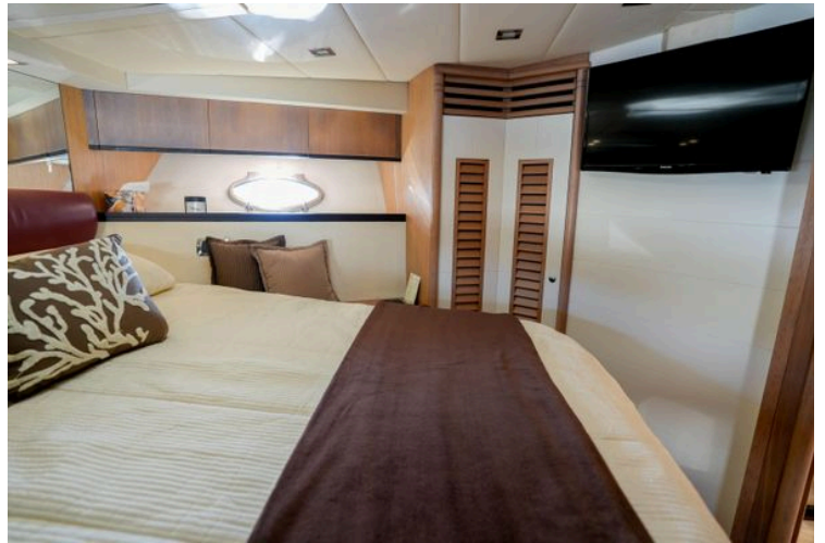
Luxurious cabin interior of 2007 Astondoa 53 Open Cruiser with elegant bedding and modern amenities.