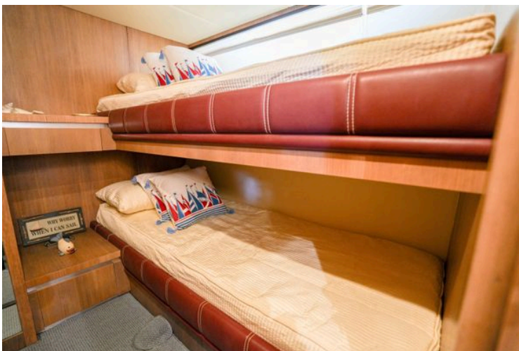
Bunk beds in 2007 Astondoa 53 Open Cruiser cabin with nautical-themed pillows.