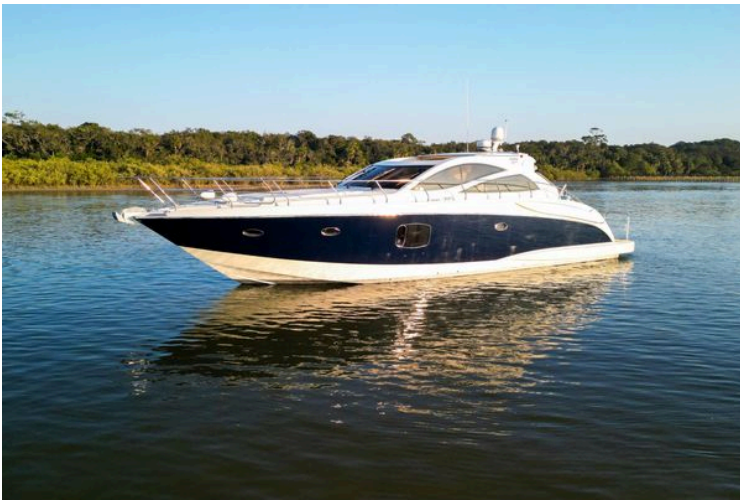
2007 Astondoa 53 Open Cruiser yacht on calm water, surrounded by lush greenery.