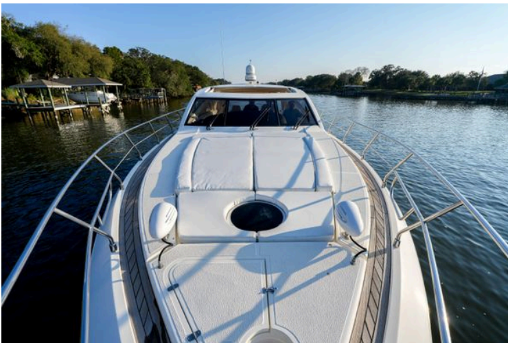
2007 Astondoa 53 Open Cruiser yacht on a serene river, surrounded by lush greenery.