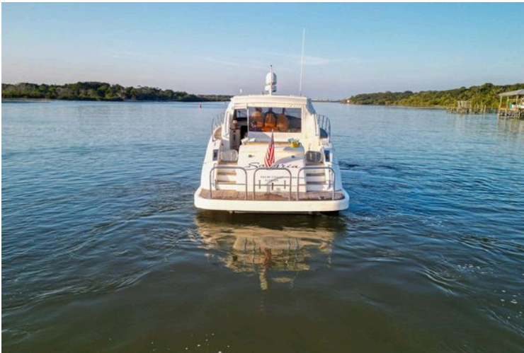
Astondoa 53 Open Cruiser 2007 on serene waterway, rear view with clear sky.