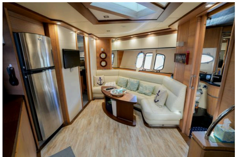
Luxurious interior of 2007 Astondoa 53 Open Cruiser yacht with modern amenities and elegant design.