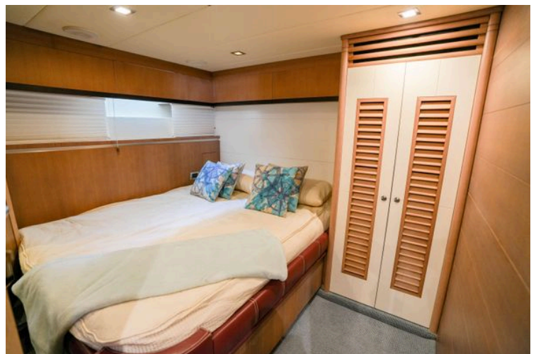
Luxurious bedroom interior of 2007 Astondoa 53 Open Cruiser yacht with cozy bedding.